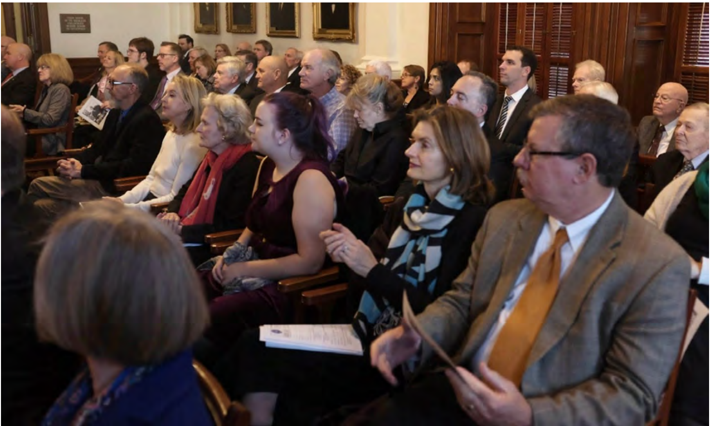
Guests filled every seat in the Supreme Courtroom, while others stood by the Courtroom's open doors to watch the Commemoration.