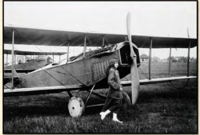
Katherine Stinson and Her Aeroplane (1915).