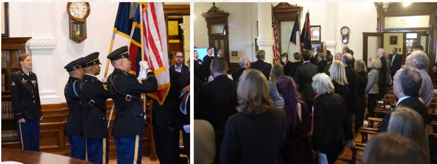
Left: The 36th Infantry Division led the way with an Honor Guard and a heart-felt delivery of The Star Spangled Banner. Right: Before the Great War Commemoration began, the Supreme Court led the audience in reciting the Pledge of Allegiance.