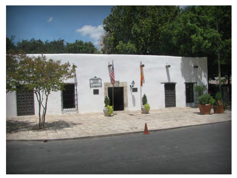
The Spanish "Governor's" Palace at 105 Plaza De Armas in San Antonio

After the late seventeenth century danger of a French invasion of East Texas lifted, King Carlos III appointed the Marquis de Rubí inspector of frontier presidios. Rubí's inspection and report