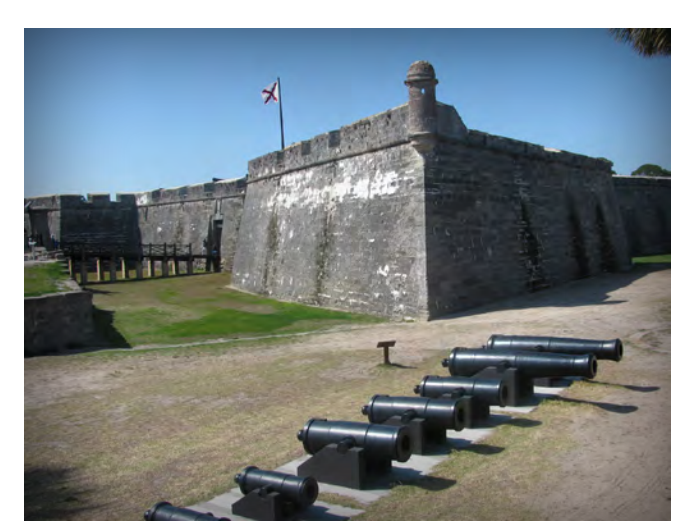
El Castillo, 1702, in St. Augustine, Florida