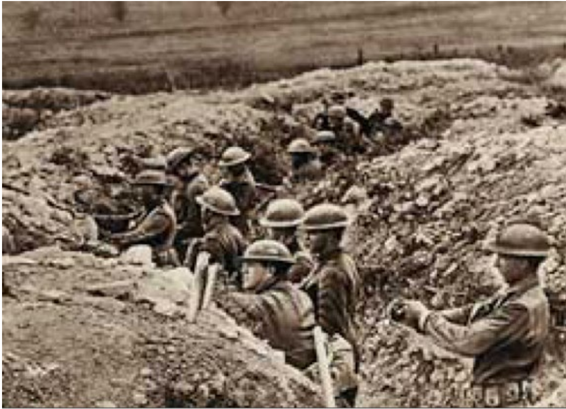
Above and below: Texas troops preparing for battle, Western Front, 1918.