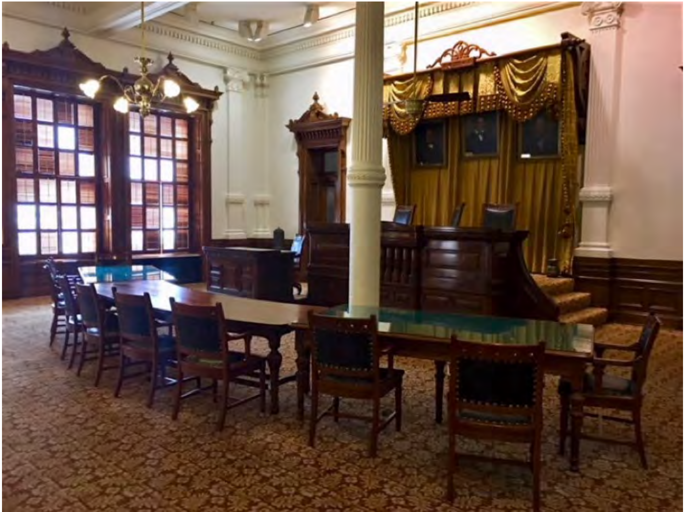
The Great War Commemoration ceremony will take place in the Texas Supreme Court Courtroom on the third floor of the Capitol.

Please consider joining the Justices of the Texas Supreme Court and our Society's Great War Commemorative Committee and Board of Trustees to honor the lives of those judges, justices, and governors of Texas who served in the Great War.