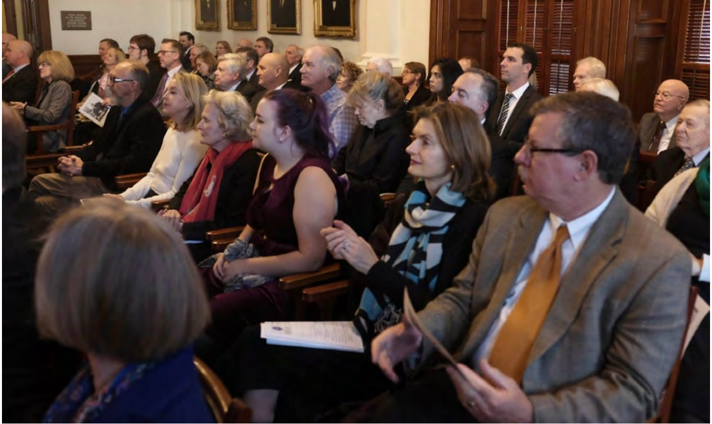
Guests filled every seat in the Supreme Courtroom, while others stood by the Courtroom's open doors to watch the Commemoration.